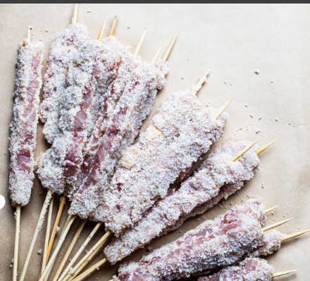
CHICKEN ( CRUMBED OR UNCRUMBED )